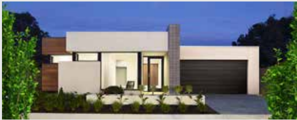
nuevo (flat roof option)