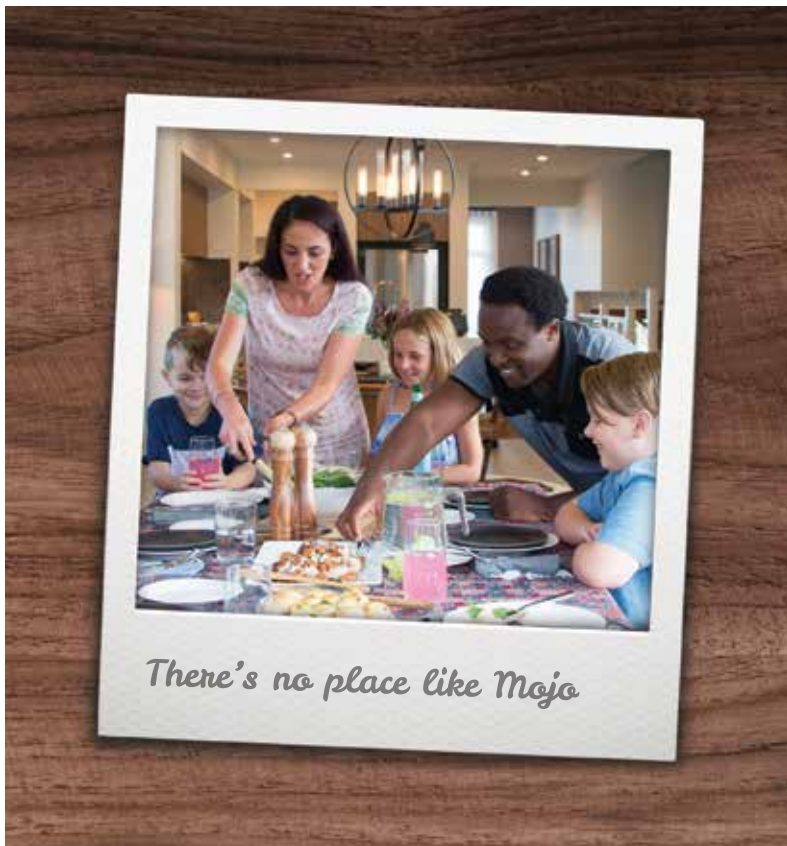
There's no place like Mojo