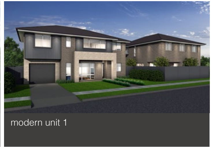
modern unit 1