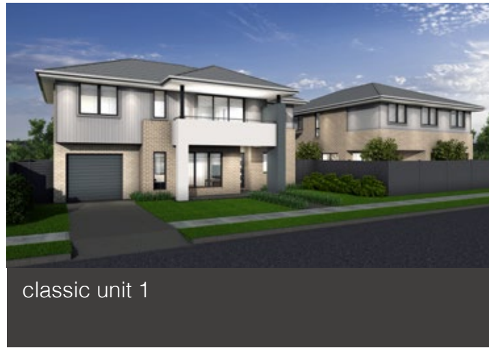
classic unit 1