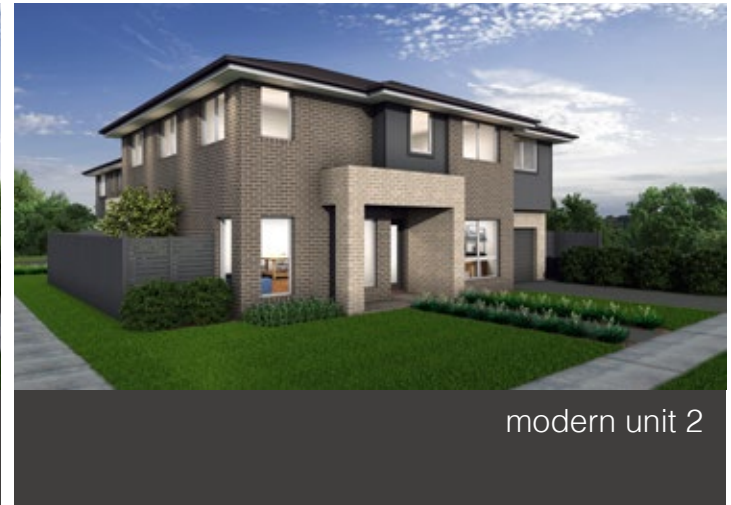
modern unit 2

Meet our brand new MOJO Duplex collection, especially designed for the way we live today. Our great range of stunning facades and contemporary floorplans, means that no matter whether you're investing or moving right on in, we have the go to option for you.