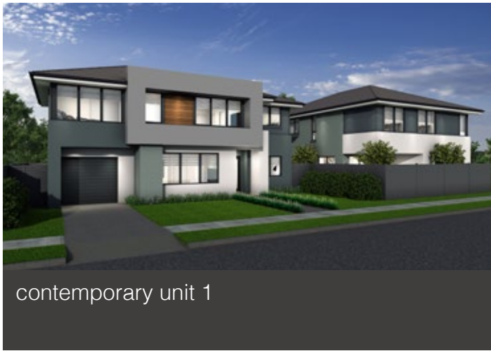
contemporary unit 1