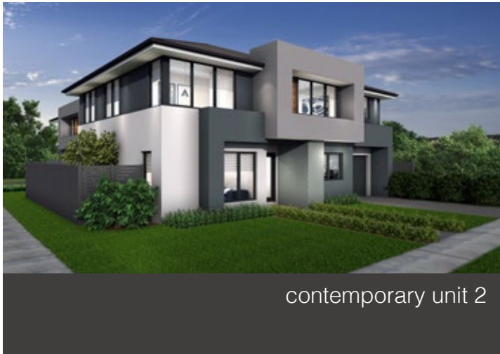
contemporary unit 2