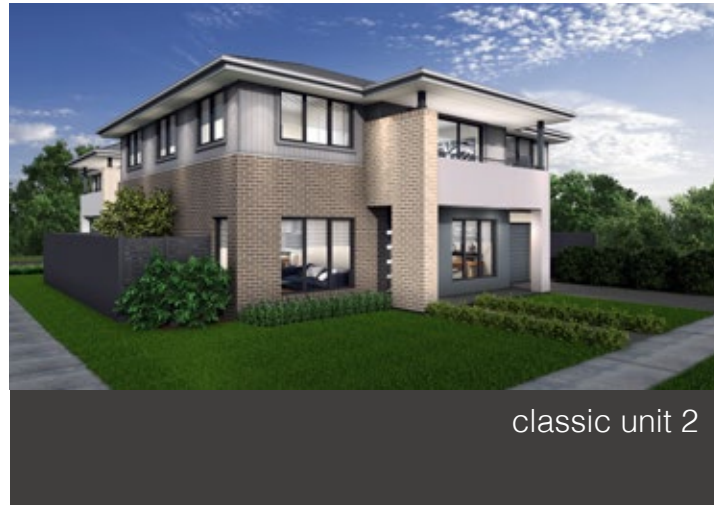
classic unit 2