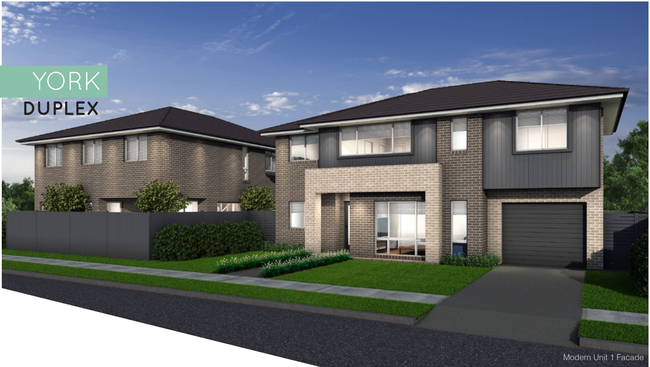
Modern Unit 1 Facade